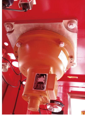
YSC650A 防坠器 Safety device

备注： 吊笼尺寸规格（长×宽×高）（m）：3.2×1.5×2.3/2.0，3.9×1.5×2.3/2.0，4.6×1.5×2.3/2.0； 也可以根据用户的要求定制。